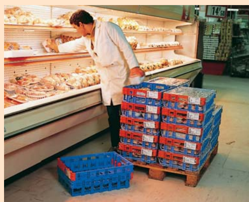
Retail distribution: compatible with standard European pallet sizes (13026).