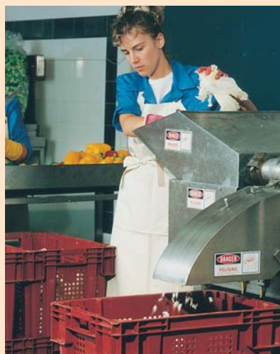
Food processing: vegetable preparation and handling (ref. 11056).