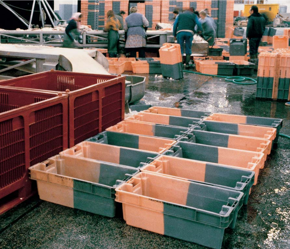
Distribution of fresh fish: protection and hygiene guaranteed with stacking and nesting containers (ref. 11061).