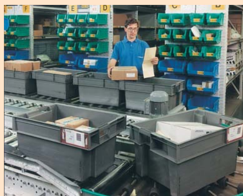
Gas Corporation: order picking of parts for nationwide distribution (ref. 11A57).