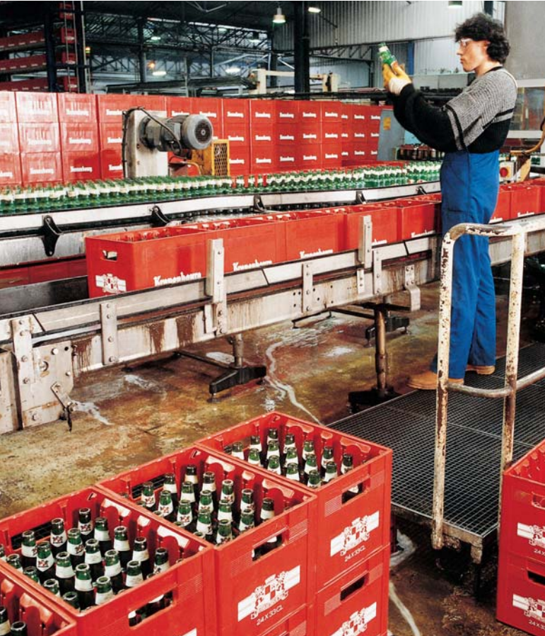
Bottle crates for efficient and safe handling in production and distribution.