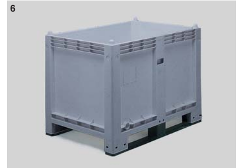
6 550 litres - Ref. 28600

minimum order item ventilated sides and base two runners dimensions as Geobox ref. 27250 Wt: 12.70 Kg/27.9 lbs., Colour: brown-red.