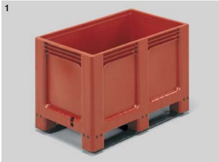
1 260 litres - Ref. 27250

solid sides and base two runners Ext. dim.: L 1,000 X w 600 X h 662 mm Ext. dim.: L 39.4 X w 23.6 X h 26.1" Int. dim.: L 929 X w 544 X h 519 mm Int. dim.: L 36.6 X w 21.4 X h 20.4" Wt: 13.50 Kg/29.7 lbs., Colour: brown-red .