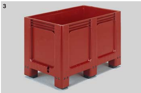
3 260 litres - Ref. 27270

solid sides and base two runners Ext. dim.: L 1,200 X w 800 X h 850 mm Ext. dim.: L 47.2 X w 31.5 X h 33.5" Int. dim.: L 1,130 X w 725 X h 690 mm Int. dim.: L 44.5 X w 28.5 X h 27.2" Wt: 27.00 Kg/59.4 lbs., Colour: grey Unit load: 400 kg/880 lbs