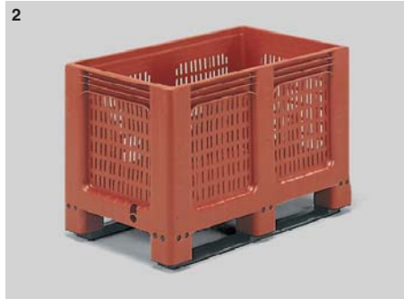
2 260 litres - Ref. 27251

solid sides and base two runners Ext. dim.: L 1,000 X w 600 X h 662 mm Ext. dim.: L 39.4 X w 23.6 X h 26.1" Int. dim.: L 929 X w 544 X h 519 mm Int. dim.: L 36.6 X w 21.4 X h 20.4" Wt: 13.50 Kg/29.7 lbs., Colour: brown-red .