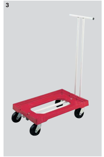
3 Ref. 910A8 As dolly ref. 91005, with handle Dim.: L 604 X w 402 X h 965 mm Dim.: L 23.8 X w 15.8 X h 38.0" four swivel castors, Ø 100 mm/4" Wt: 8.90 kg/19.6 lbs. Colour: red.