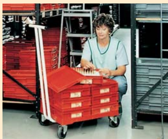
Pharmaceutical industry: manoeuvrability in cramped areas. (ref: 910A8).