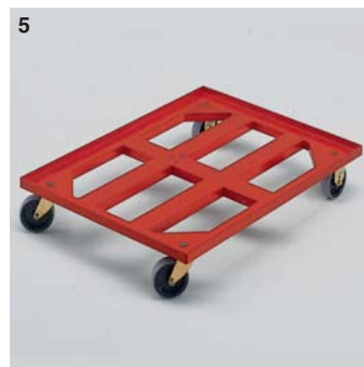
5 Ref. 99822 Rubber wheels on galvanised mountings two fixed, two swivel castors, diameter 100 mm/4".