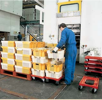
Automotive supplier: dollies allow stable stacking of containers (ref. 91005).