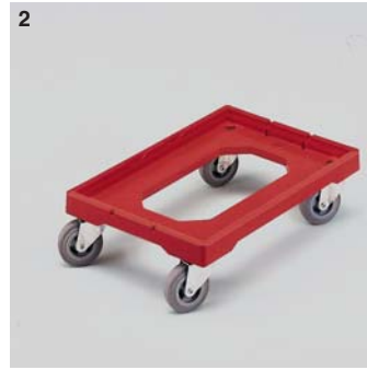
2 Ref. 91011 minimum order item Rubber wheels on galvanised mountings Dim.: L 604 X w 402 X h 162 mm Dim.: L 23.8 X w 15.8 X h 6.4" four swivel castors, Ø 100 mm/4" loading: 250 kg/550 lbs Wt: 4.00 kg/8.8 lbs. Colour: red.