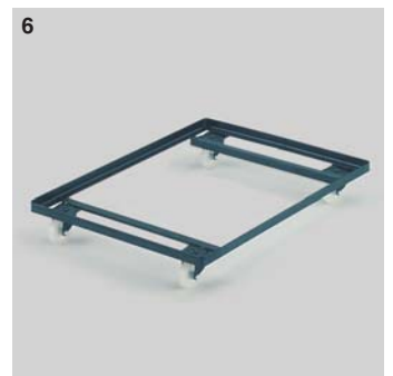
6 Ref. D8060 steel dolly for 800 X 600 mm ESR containers four swivel nylon castors, diameter 76 mm/3" Colour: black.