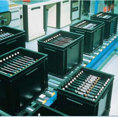
Electronic components: conductivity assured with Q7 containers