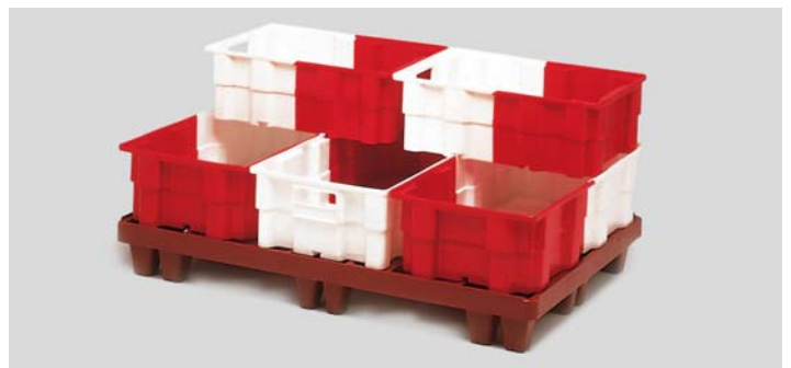
Cross stacking of containers ref. 14040 and 14060 on a 1,200 x 800 mm pallet.

Ext. dim.: L 800 X w 400 X h 200 mm Ext. dim.: L 31.5 X w 15.8 X h 7.9" Int. dim.: L 707 X w 341 X h 174 mm Int. dim.: L 27.8 X w 13.4 X h 6.8" nested height: 102 mm/4.0" stacked height: 189 mm/7.4 capacity of retention channel in base: 0.6 l Wt: 2.7 kg/5.6 lbs. Colour: white/red. manufactured in freezer grade HDPE SKU quantity: 30