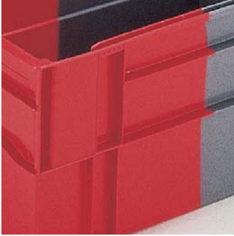
Smooth surfaces allowing easy cleaning (ref. 13042 and 13050).