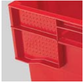
Area with pimple-pad for adhesive labels.