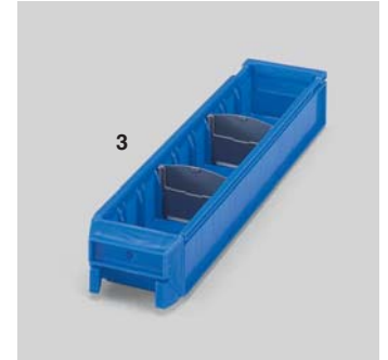
3 Ref. 78L10

polypropylene grooves for up to 6 dividers Ext. dim.: L 400 X w 230 X h 80 mm Ext. dim.: L 15.8 X w 9.1 X h 3.2" Int. dim.: L 350 X w 210 X h 75 mm Int. dim.: L 13.8 X w 8.3 X h 3.0" Wt: 0.56 kg/1.2 lbs., Colour: blue. SKU quantity: 10 per carton.