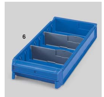
6 Ref. 78L20

polypropylene grooves for up to 8 dividers Ext. dim.: L 500 X w 230 X h 80 mm Ext. dim.: L 19.7 X w 9.1 X h 3.2" Int. dim.: L 450 X w 210 X h 75 mm Int. dim.: L 17.7 X w 8.3 X h 3.0" Wt: 0.68 kg/1.5 lbs., Colour: blue. SKU quantity: 10 per carton.