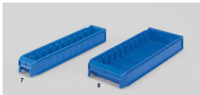
7 3.9 litres - Ref. 78610*

polypropylene divider for trays ref. 78420, 78520 & 78620. Dim.: 207 X 69 mm Dim.: 8.1 X 2.7" Wt: 0.04 kg/0.08 lbs. Colour: grey.