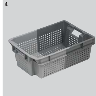
4 32 litres - Ref. 11034

Ext. dim.: L 600 X w 400 X h 200 mm Ext. dim.: L 23.6 X w 15.8 X h 7.9" Int. dim.: L 457 X w 338 X h 177 mm Int. dim.: L 18.0 X w 13.3 X h 7.0" nested height: 60 mm/2.4" Wt: 1.84 kg/4.1 lbs. Colour: grey/light grey, grey/red , white, red. SKU quantity: 80