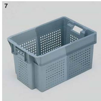
7 50 litres - Ref. 11053

Ext. dim.: L 600 X w 400 X h 300 mm Ext. dim.: L 23.6 X w 15.8 X h 11.8" Int. dim.: L 460 X w 340 X h 270 mm Int. dim.: L 18.1 X w 13.4 X h 10.6" nested height: 85 mm/3.3" Wt: 2.30 kg/5.1 lbs. Colour: red, grey, grey/light grey, grey/red , white. SKU quantity: 50