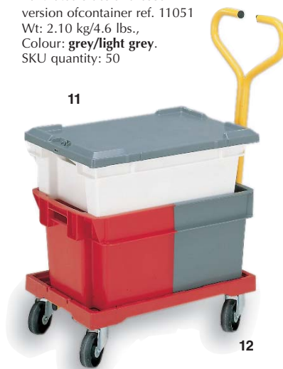
11 Ref. 61046

ventilated sides and base version of ref. 11065 Wt: 2.65 kg/5.8 lbs. Colour: grey . SKU quantity: 35