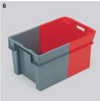
6 50 litres - Ref. 11051

To secure palletised loads of Eurorange and Traditional stacking & nesting containers in conjunction with 1,000 x 1,200mm Packpal pallet with perimeter runners and Jumbopal pallet with 3 runners. Ext. dim.: L 1,246 x w 1,046 x h 89mm Ext. dim.: L 49.1 x w 41.2 x h 3.5" Wt: 5.2 Kg/11.4 lbs., Colour: grey.