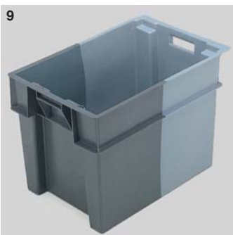
9 70 litres - Ref. 11065

Cover ref. 64701 and Packpal pallet ref. 3F503 with 20 containers ref. 11032. See p.92