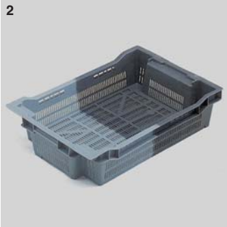
2 18 litres - Ref. 11020

ventilated sides and base Ext. dim.: L 600 X w 400 X h 117 mm Ext. dim.: L 23.6 X w 15.8 X h 4.6" Int. dim.: L 458 X w 338 X h 102 mm Int. dim.: L 18.0 X w 13.3 X h 4.0" nested height: 34 mm/1.3" Wt: 1.09 kg/2.4 lbs. Colour: grey/light grey. SKU quantity: 150