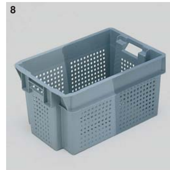
8 50 litres - Ref. 11052

minimum order item solid base, ventilated sides version of container ref. 11051 Wt: 2.27 kg/5.0 lbs. Colour: grey/light grey.