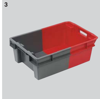
3 32 litres - Ref. 11032

ventilated sides and base Ext. dim.: L 600 X w 400 X h 117 mm Ext. dim.: L 23.6 X w 15.8 X h 4.6" Int. dim.: L 458 X w 338 X h 102 mm Int. dim.: L 18.0 X w 13.3 X h 4.0" nested height: 34 mm/1.3" Wt: 1.09 kg/2.4 lbs. Colour: grey/light grey. SKU quantity: 150